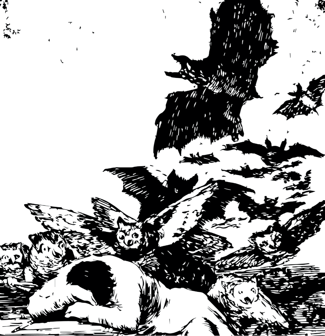
El sueño de la razón produce monstruos, Goya, 1799.