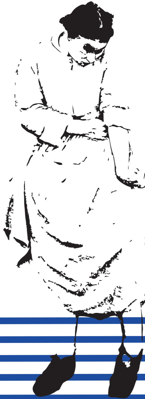
Vectorisation of a photograph of a patient at the Salpêtrière hospital in Paris in the 1870s.